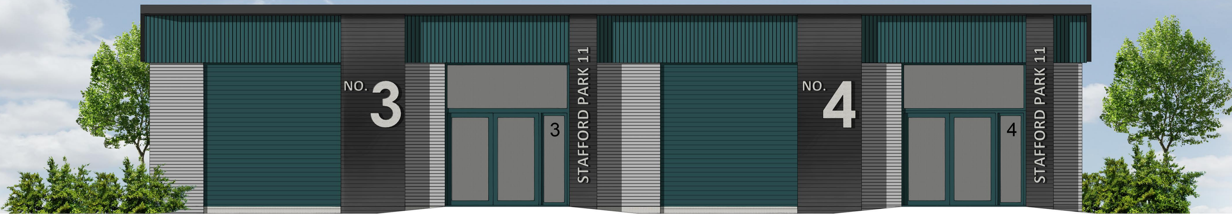
PROPOSED NORTH ELEVATION (FRONT)

This document and its design content is copyright ©. It shall be read in conjunction with all other associated project information including models, specifications, schedules and related consultants documents. Do not scale from this drawing. All dimensions to be checked on site. Immediately report any discrepancies, errors and omissions to the originator. If in doubt ASK. © Crown copyright [and database rights] 2015 Ordnance Survey 100019694. Re-use of additional photo copies of this map are not permitted except where the end user holds a relevant licence with Ordnance Survey. Safety Health and Environmental Information Box Construction Risks, Maintenance/Cleaning Risks, Demolition/Adaptation Risks: