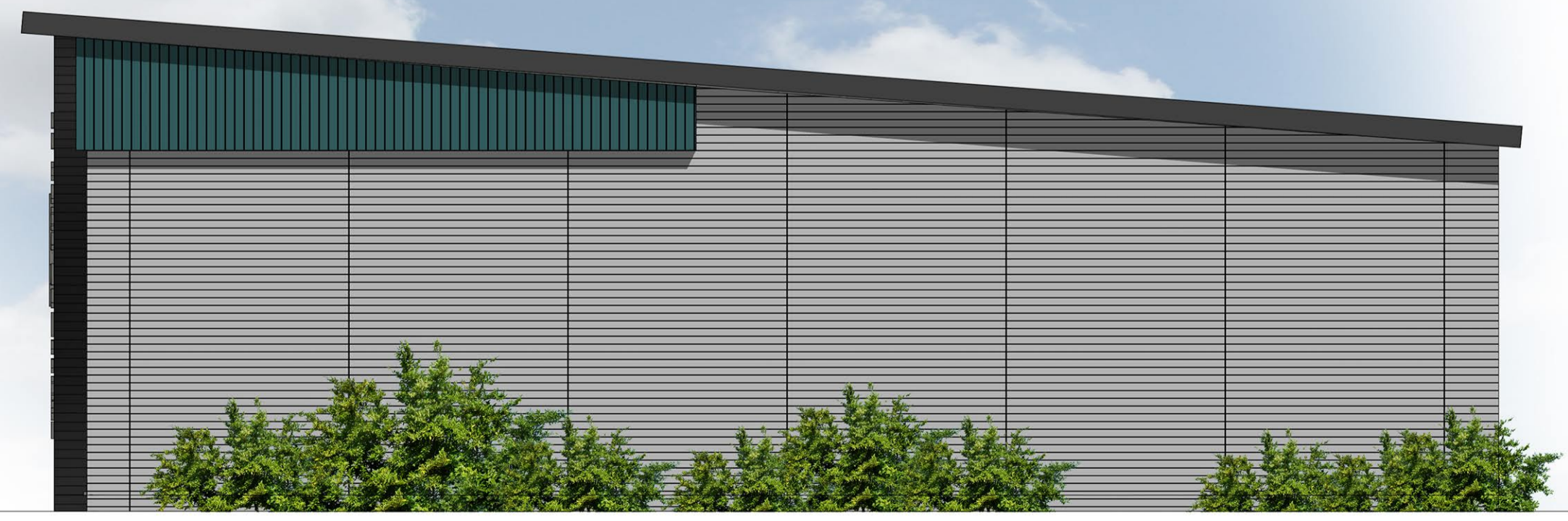
PROPOSED WEST ELEVATION (END)