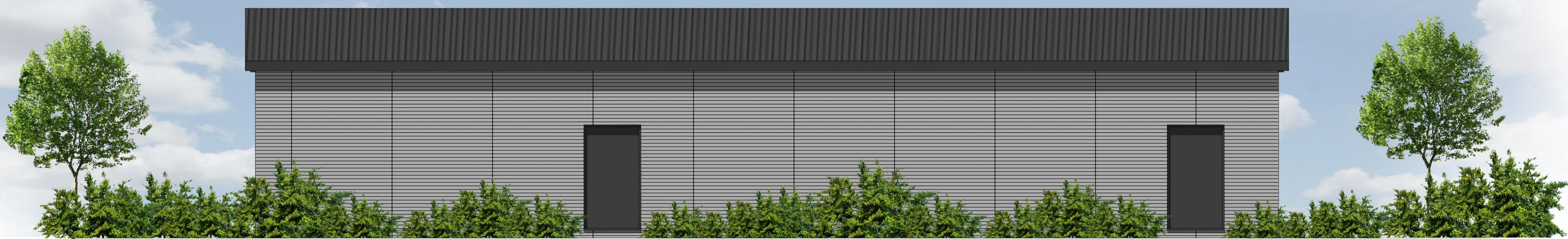
PROPOSED SOUTH ELEVATION (REAR)